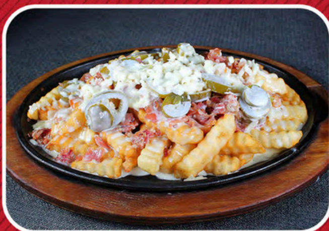
EL TORIL FRIES