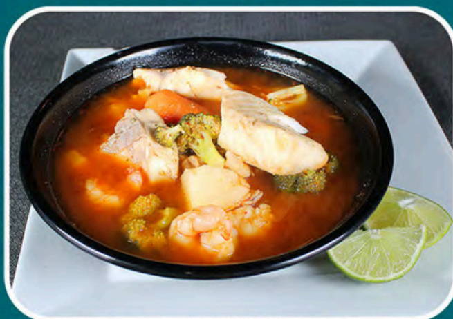
CALDO DE CAMARON Y PESCADO