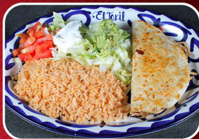
GRILLED QUESADILLA RELLENA