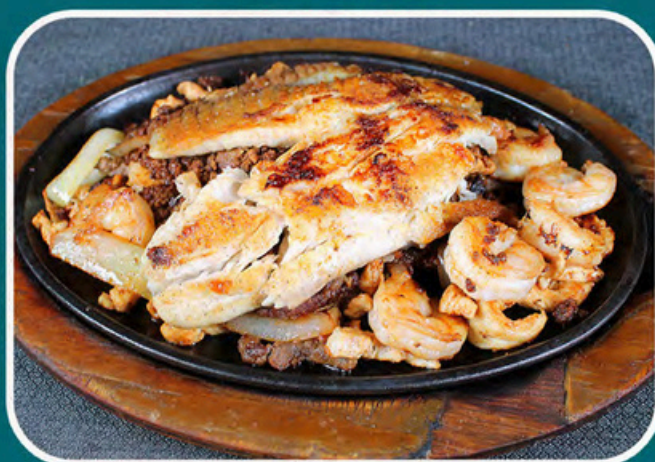
MAR Y TIERRA