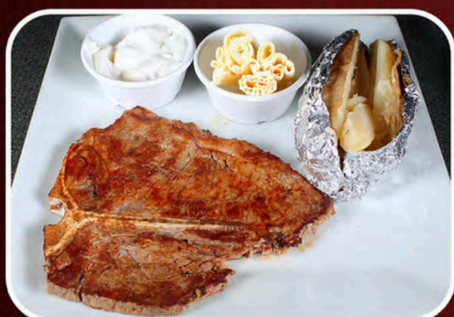
*T BONE AND BAKED POTATO