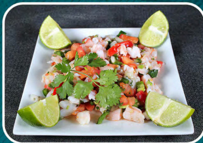
CEVICHE DE CAMARON