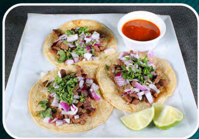
*TACOS MEXICAN STYLE